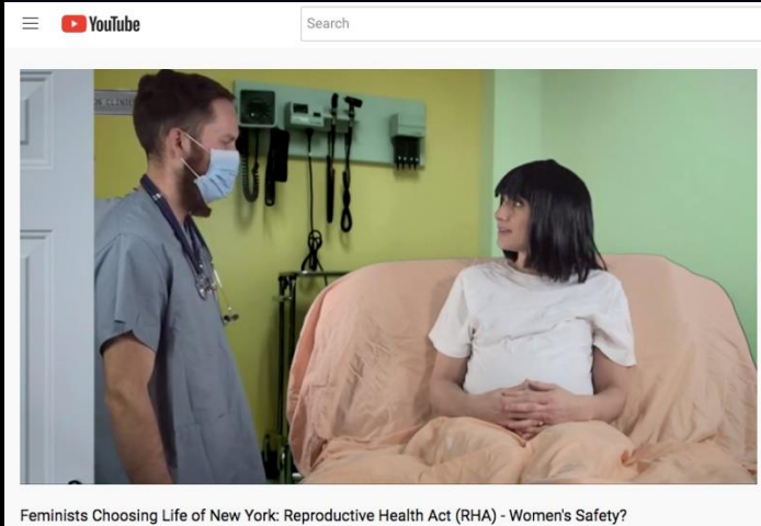
Feminists Choosing Life of New York: Reproductive Health Act (RHA) - Women's Safety?

NY's Reproductive Health Act (RHA) removed NY's long-standing requirement that only duly licensed physicians perform abortions and that a 2nd physician be present during later-term or surgical abortions performed on fetuses 20+ weeks gestation.